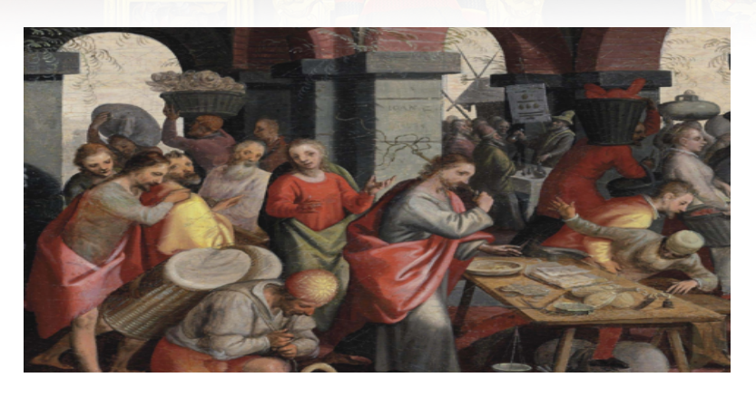
Growing and Deepening our Spiritual Lives in an Affirming and Inclusive Community

"The Temple: Risking Righteous Anger" Week Two of Lent