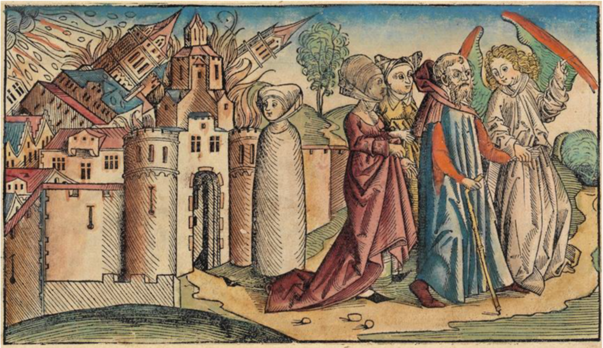
The Sodom and Gomorrah motif from the Nuremberg Chronicle by Hartmann Schedel , 1493. Note Lot's wife, already transformed into a salt pillar, in the center